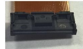
CN1 BOTTOM VIEW